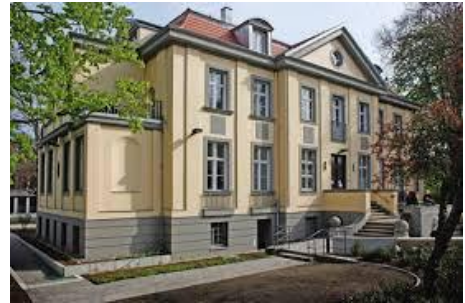
Topoi Building Dahlem

Website: https://www.topoi.org/home/buildings/