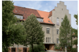
The Graduate School of North American Studies, approved in the first funding round of the Excellence Initiative, is part of the John F. Kennedy Institute.