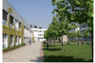
Science Campus Dahlem: Berlin Mathematical School, a project of the three large Berlin universities, was approved in the first funding round of the Excellence Initiative.