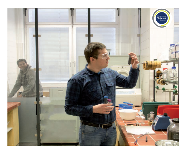
Research at the co-working lab focuses on various things, including charging graphene layers with positively or negatively charged polymers in order to capture viruses and bacteria.

The new Freie Universität incubator is located at Altensteinstraße 40. In the future, university startups will work there under the same roof as the employees of Profund Innovation and the Digital Entrepreneurship Hub. This site is immediately adjacent to the grounds of the planned FUBIC technology and start-up center, where young companies will find room to grow.