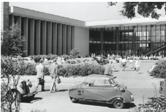
View of the Henry Ford Building from Boltzmannstraße in 1959.