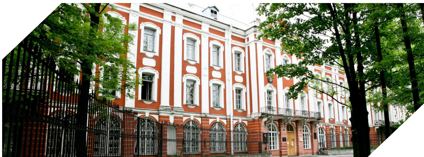
The main campus, Saint Petersburg State University, St. Petersburg

If your field of study is related to environmental sustainability you might be interested in the events offered by the Institute of Earth Sciences or you can just email them ( politreg.earth@spbu.ru ). However, you should contact your program coordinator or supervisor for any advice they can give, they can also suggest initiatives for you to join or to notify you of upcoming events.