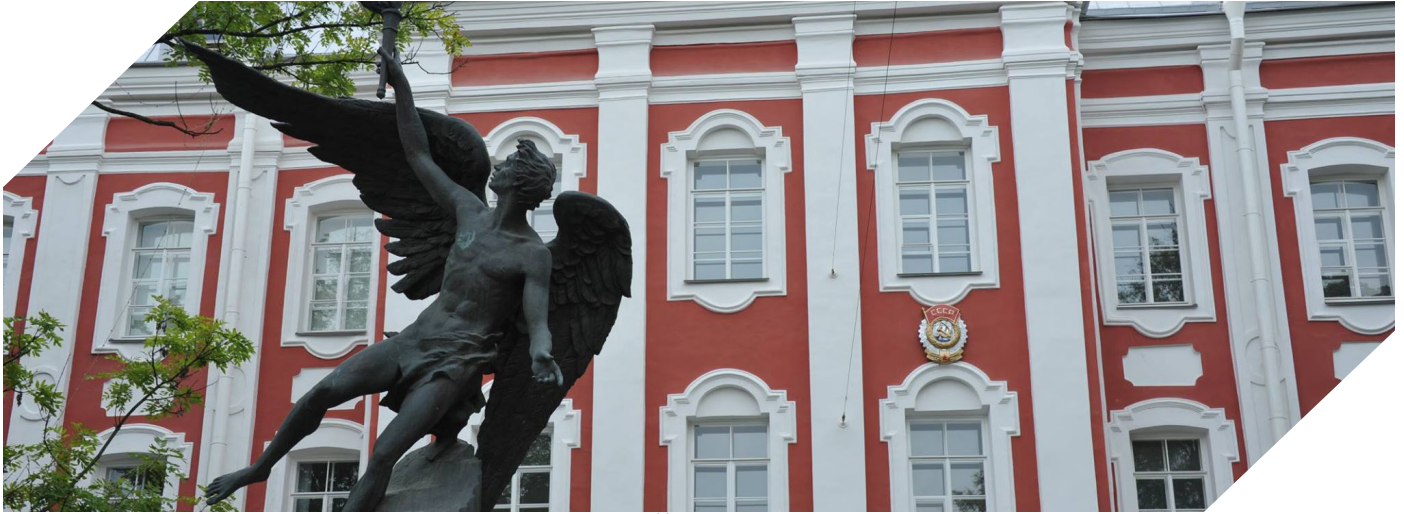
The main campus, Saint Petersburg State University, St. Petersburg

Most of the courses at the university are in Russian, so pay attention to that as you register for courses. As an exchange student, you can work in the library but you won't have access to an office or your own working space. Once you get in touch with people at the university, everyone is going to be very helpful, welcoming and easy-going.