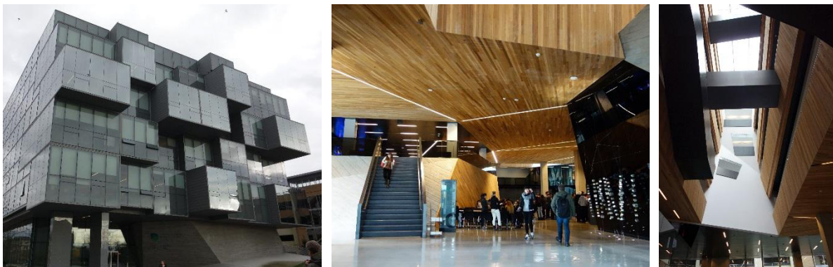
The Pharmaceutical Sciences Building