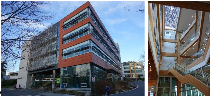
CIRS – Center for Interactive Research on Sustainability

Campus Tour, visit of the LEED certified buildings: CIRS – Centre for Interactive Research on Sustainability, the new Pharmaceutical Sciences Building, the Buchanan Complex for Art Studies, the Building of the Forest Faculty, Chemistry Building.