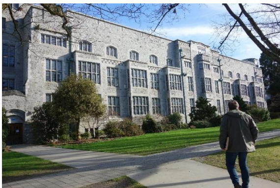
The Chemistry Building