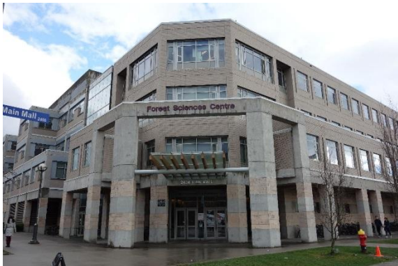
The Forest Science Centre