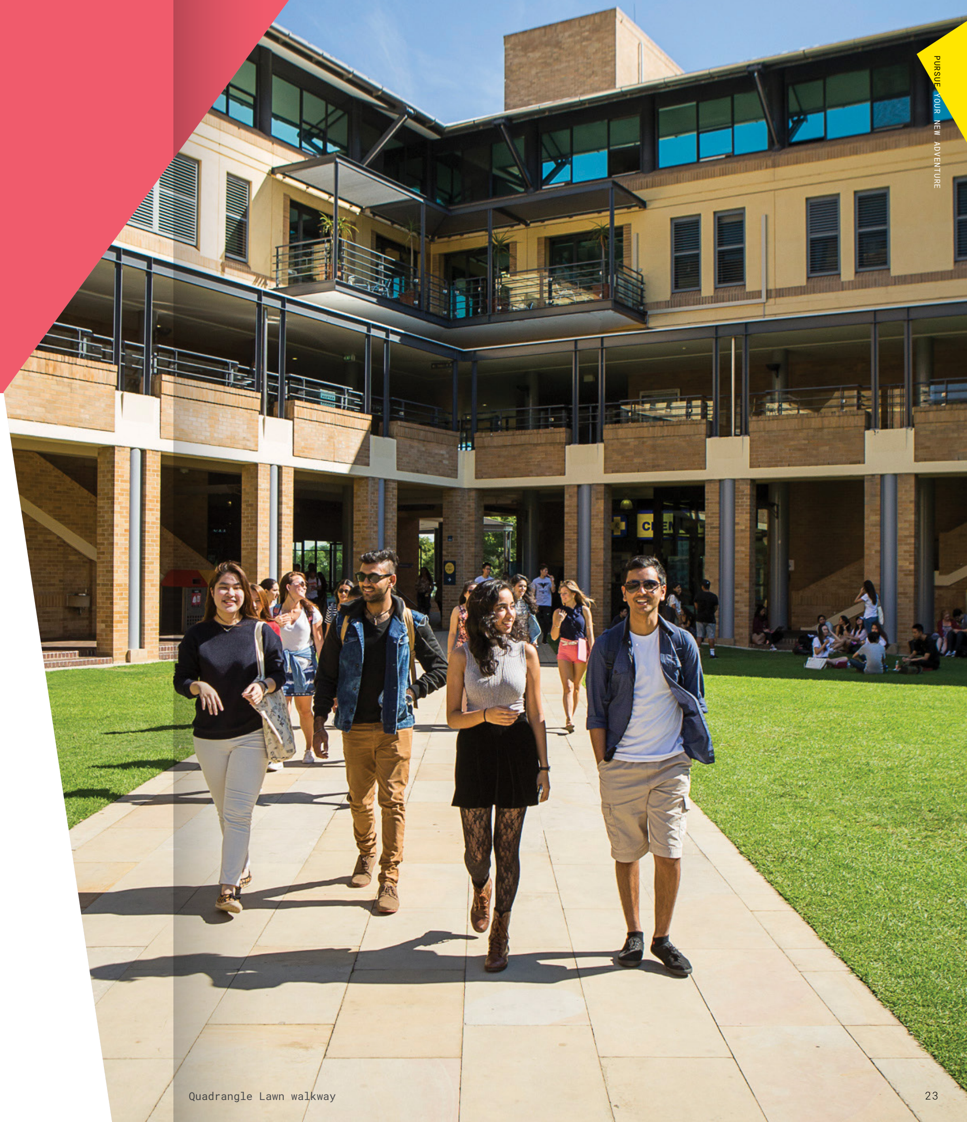
Quadrangle Lawn walkway

Enrolment is subject to course availability and your academic background. It is important to be flexible with your course choice as some fill up quickly or may not be offered in a particular term.