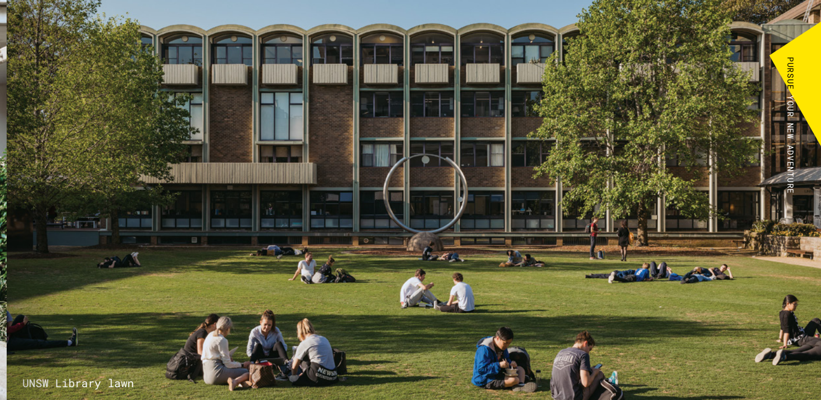
UNSW Library lawn