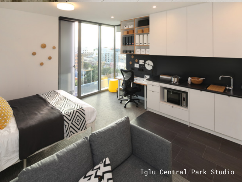
Iglu Central Park Studio