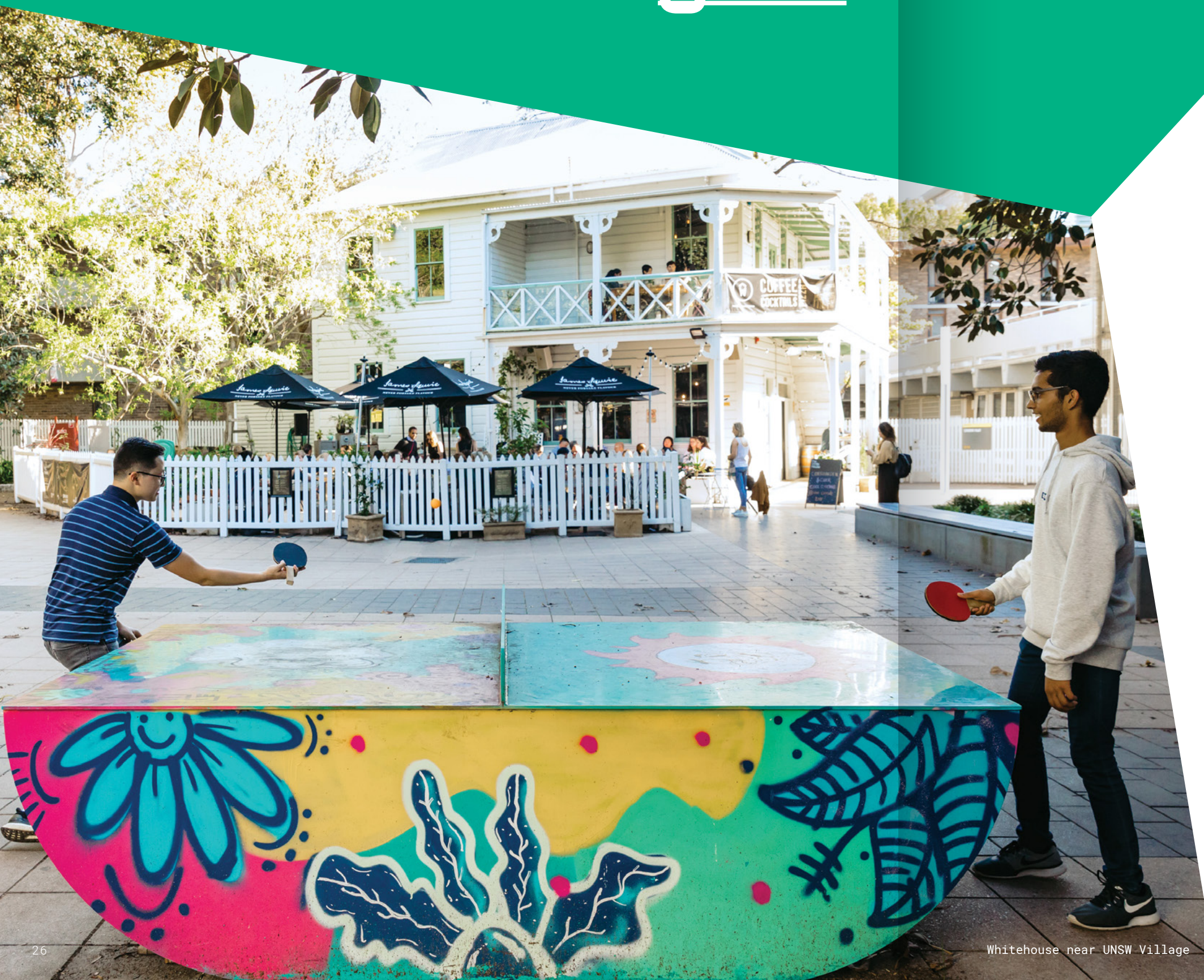
Whitehouse near UNSW Village

The UNSW campus is in the Eastern Suburbs of Sydney and many students choose to live by the beach in Coogee, Clovelly, Maroubra or iconic Bondi Beach. UNSW is a commuter campus, so, the majority of local and international students live off campus. Sydney is a safe, accessible and vibrant city, with public transport connecting the UNSW campuses to nearby beaches and the city centre.