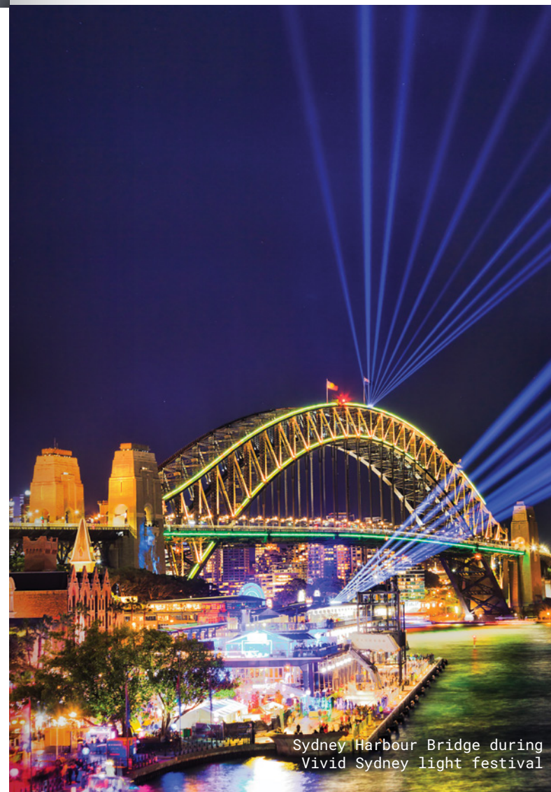
Sydney Harbour Bridge during Vivid Sydney light festival

international.unsw.edu.au/sydney-worlds-best