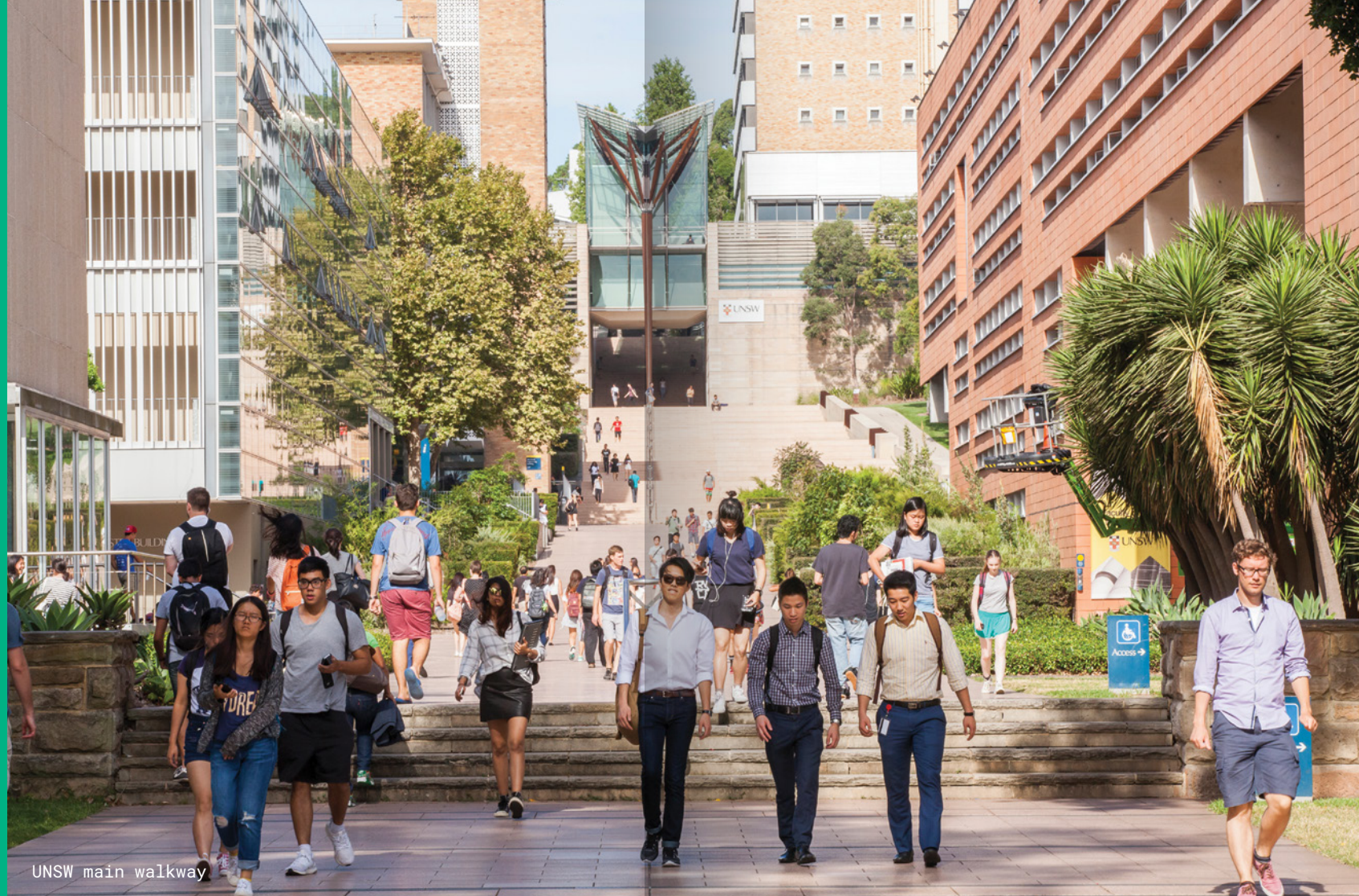
UNSW main walkway

A top 50 university with fantastic campus life!