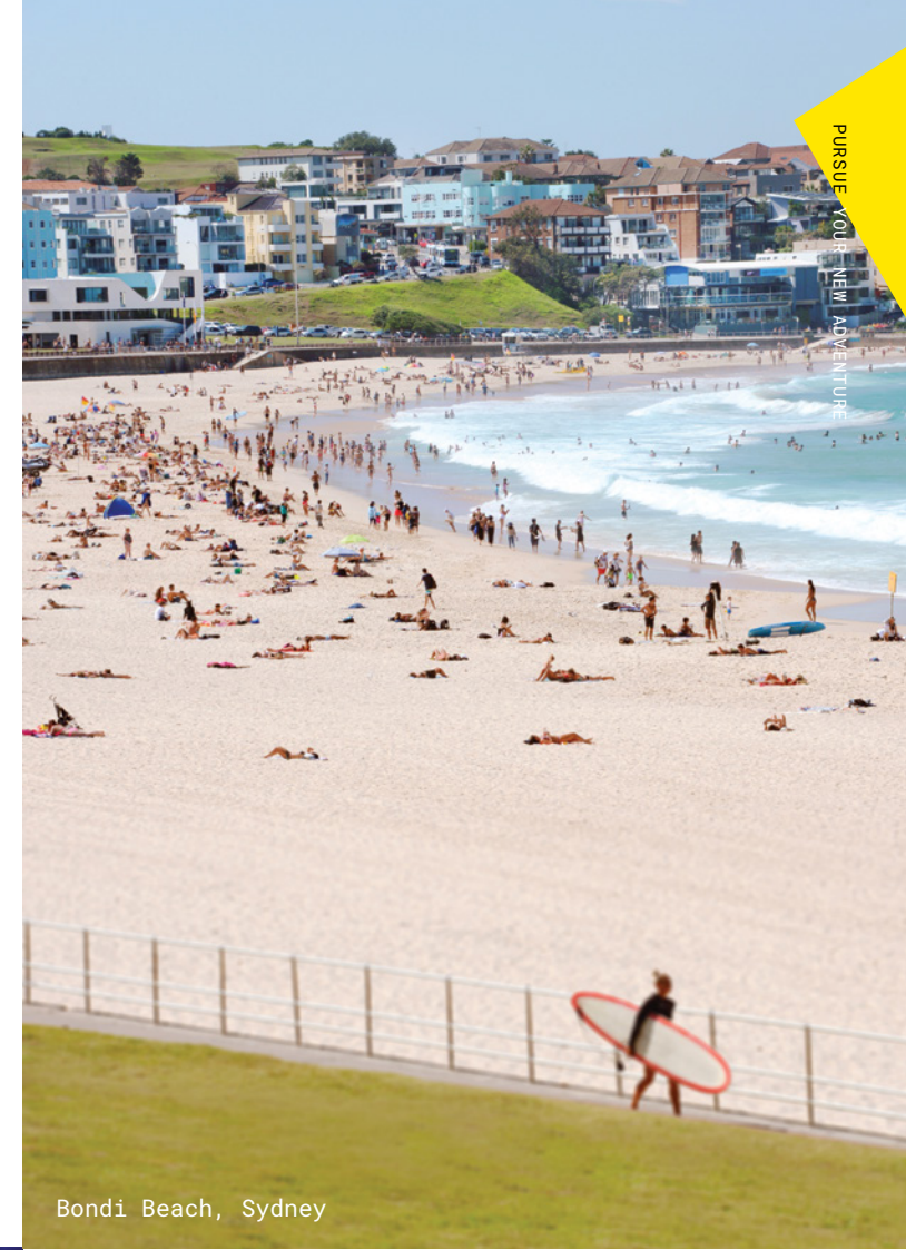
Bondi Beach, Sydney