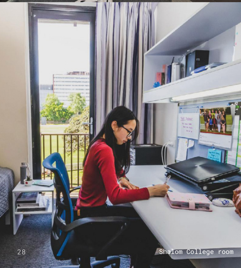
Shalom College room