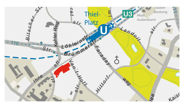
Harnack-Haus der Max-Planck-Gesellschaft, Ihnestraße 16–20, 14195 Berlin