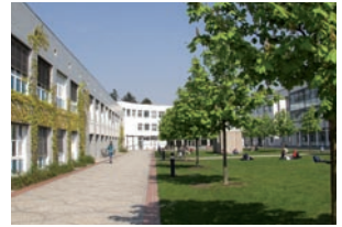
Science Campus Dahlem: Berlin Mathematical School, a project of the three large Berlin universities, was approved in the first funding round of the Excellence Initiative.