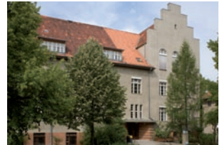
The Graduate School of North American Studies, approved in the first funding round of the Excellence Initiative, is part of the John F. Kennedy Institute.