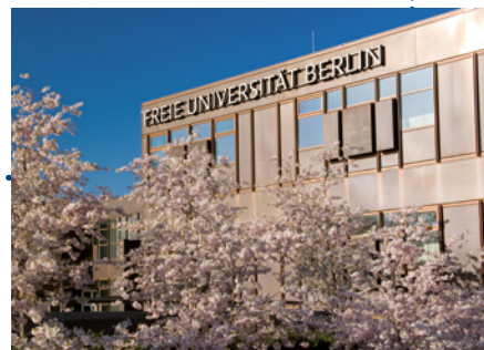
Design: Freie Universität Berlin, Center for Digital Systems